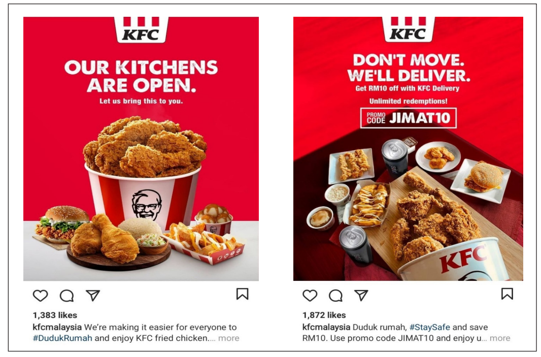
Figure 2. Replication of hashtags signs (KFC)

These stylistic adaptations and adoption of hashtag signs exhibit commercial business support of the national agenda where both