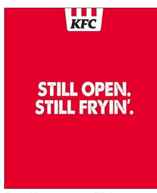
Figure 6. Language patterns (KFC)

you are close to my heart). Muad says, 'I selalu bersihkan permukaan kerap disentuh di kedai, sebagai sambutan special untuk you' (I always clean frequently touched surfaces at the store to welcome you). Using pronoun references, 'I' and 'you' are common among Malay speakers when speaking Malay (Othman, 2006). Words of stay safe, safety, 'keselamatan' (safety) and 'bersihkan' (clean) are in bigger fonts than the rest of the text to manifest the food chain's commitment to adhering to hygienic practices. The exception is Sethulingam, who uses only English. His words are merely adaptations of viral signs by medical personnel on social media- We stay at work for you. You stay at home for us. The brand's Instagram caption says I come to work every day to make your favourite pizza, so you can stay at home. The adapted lines maintain most of the original sentence structures and words but tune them to adapt