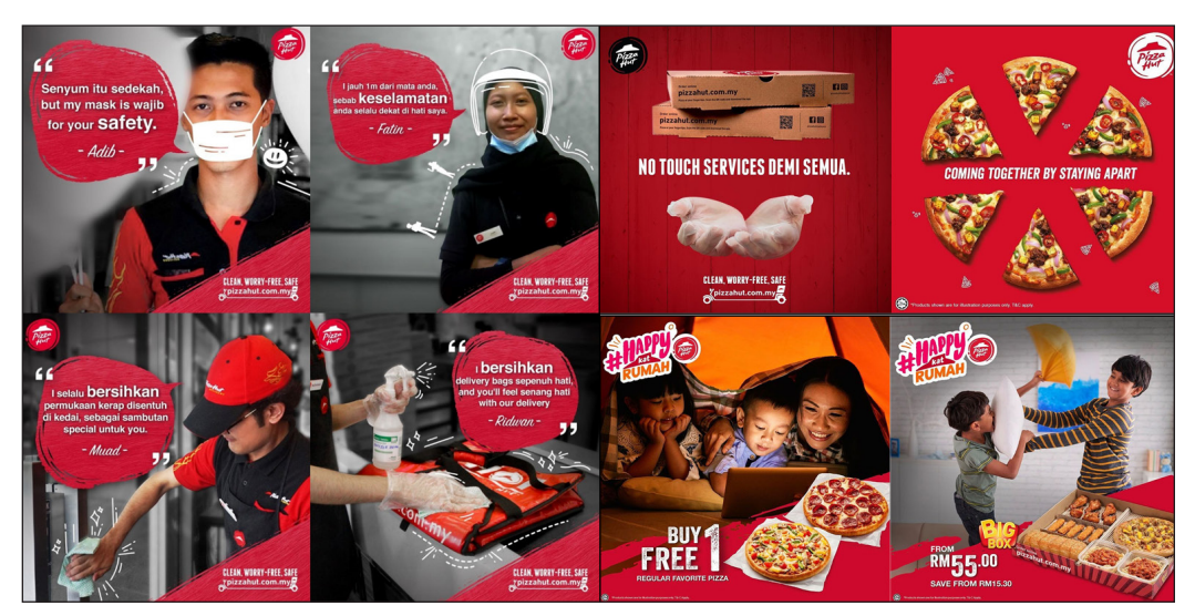
Figure 3. Choice of image and graphic patterns (Pizza Hut)

Another set of images displayed the practice of social distancing adopted by the company- open palm hand gestures and split a pizza. It can be deduced that the literal explanation of the former refers to sanitised