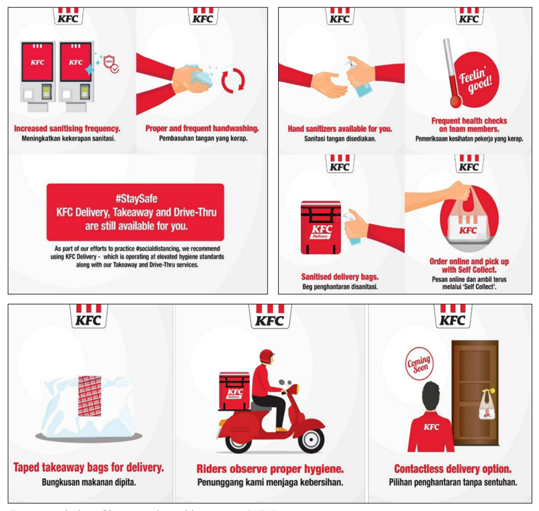
Figure 4. Choice of image and graphic patterns (KFC)

KFC posted vector images of ten standard operating procedures on March 18, 2020 (Figure 4). Vector graphics were easily sized and customised using computer software as creating ten advertisements using human models can be costly and time-consuming. All images came with captions underneath. Similarly, McDonald's one-week posts that comprised six advertisements related to COVID-19 were also computer generated (Figure 1). McDonald's captions needed to be read with the accompanying images.